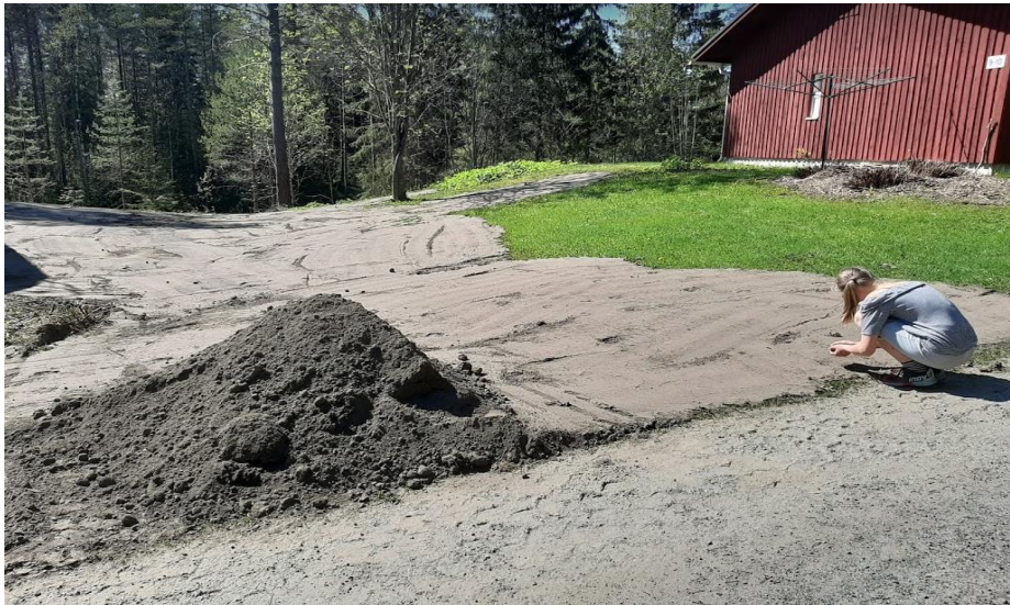
Picture. The use of the end product in landscaping in the city of Mikkeli (Picture Panu Jouhkimo, Miksei).