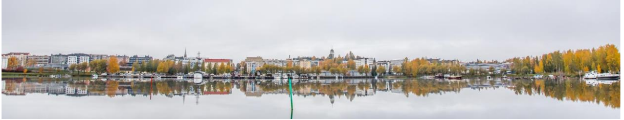
Picture. Mikkeli wants to improve the recovery of nutrients from bio-waste streams.

processes will be performed to obtain possible business cases for Mikkeli.