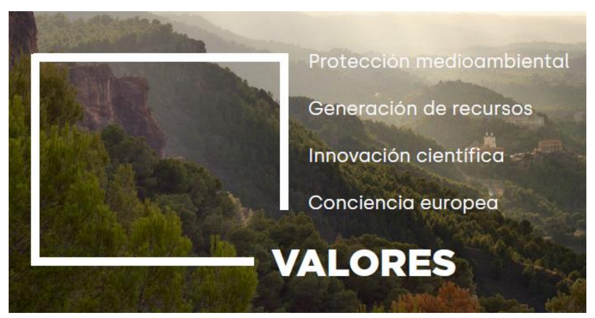
Fig. 1. Educational campaign values

We are facing the challenge of presenting, explaining, raising awareness, motivating citizens and generating a coherent and long-lasting identity over time for a project that we consider to be revolutionary. The first component of any communication campaign is about the values that want to be transmitted. These are summarized in the following slide (Fig. 1): environmental protection, resource generation, scientific innovation and European awareness.