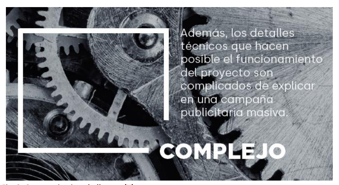
Fig. 3. Communication challenges (II).

In order to effectively communicate such a complex problem, we have chosen a simple design together with a simple and effective message that summarises and added value to the entire project. This common minimum is, from now on, that there is one more container for biowaste, a container that must be integrated into the habits of the citizens. This container could be seen as one additional container to the existing ones. But, in our case, the whole idea to transmit is that this new container adds much more value (Fig. 4). Thus, the main motto of the campaign can be translated as: "A small contribution with provides great results" (Fig. 4). Such results or advantages come as follows: