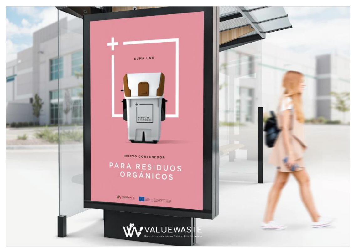
Fig. 14. Example of poster in public transport areas