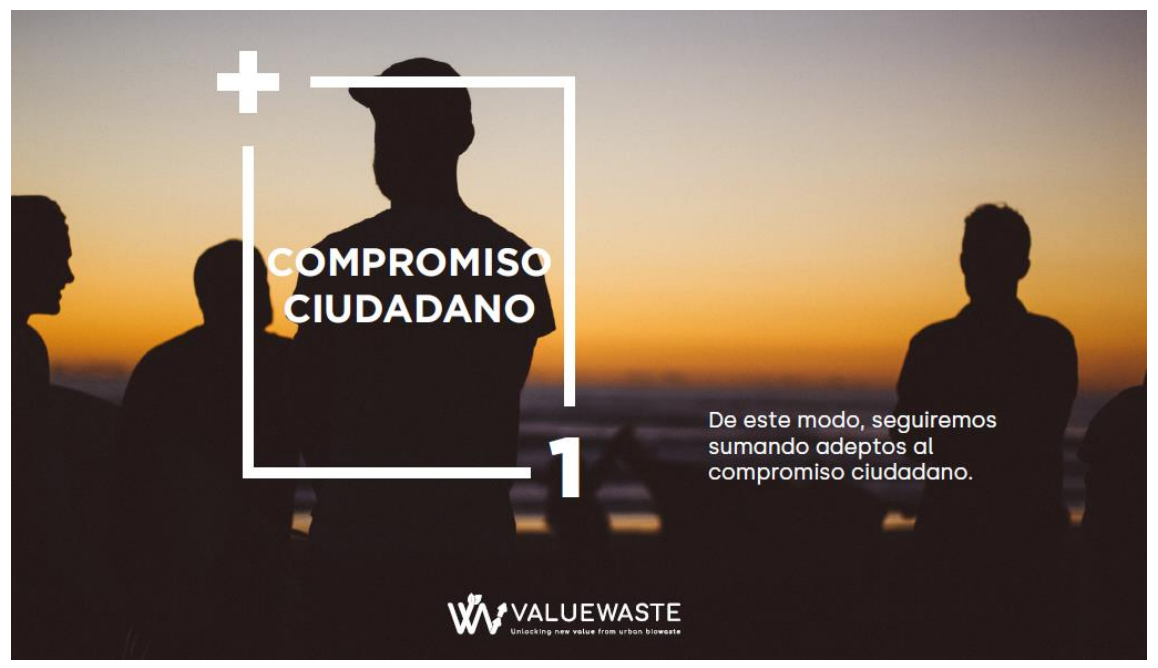
Fig. 11. Citizen Commitment (II).

As it has been stated, the main character of the campaign is the new container. Therefore, we will proceed to label the different containers with the graphic image designed for the project so that they are clearly identified. In addition to identify the project, it is important for the containers to specify the type of wastes to dispose in order to avoid confusion and impropriety. To achieve this, instead of using the logo as it is, we will adapt the identity to the message (Fig. 6).