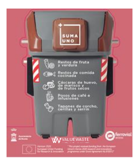
Fig. 12. Fridge magnet