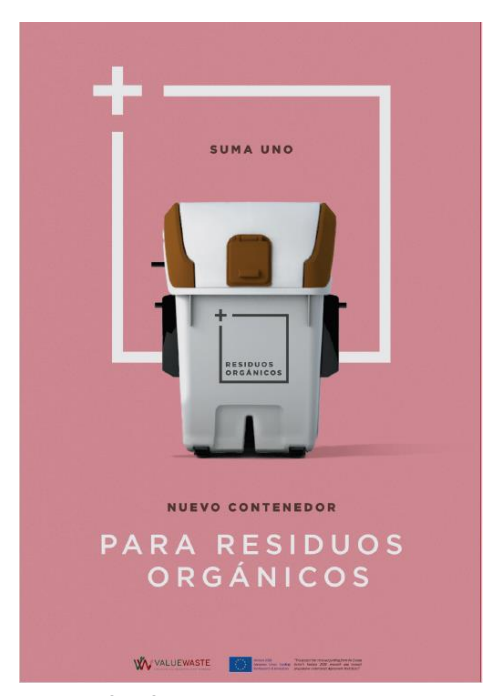
Fig. 13. Draft of the new container poster

Posters have been designed to support the identification of the new container (Fig. 13). They will be located in public places including public transport stops (Fig. 14).