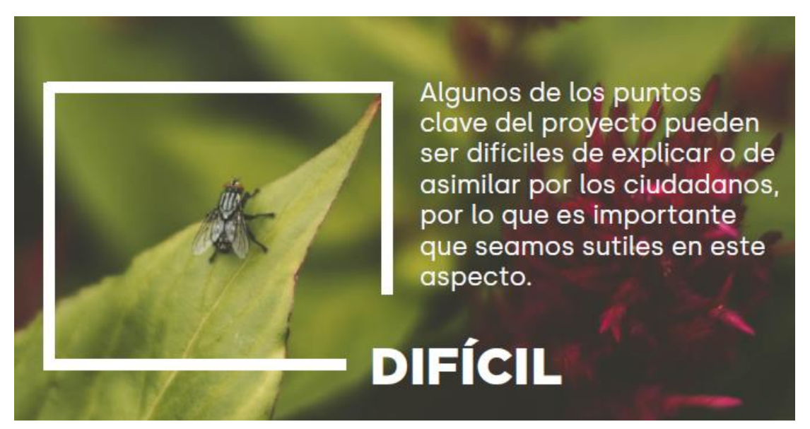
Fig. 2. Communication challenges (I)