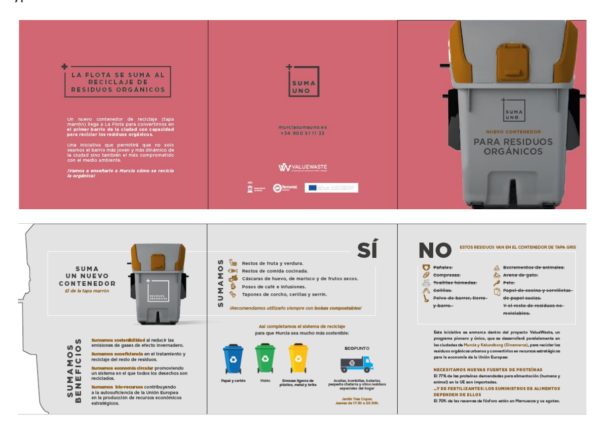
Fig. 7. Valuewaste brochure

(homes, restaurants and markets). Three different versions will be developed as function on the type of audience to be addressed.